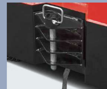
Upon special design, the traction device can prevent the towing pin coming off during traveling