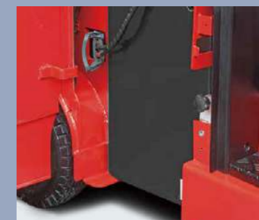
The battery can be removed from truck side, so it is very convenient for battery maintenance