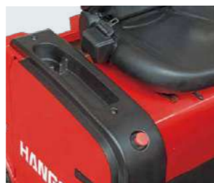
Cup holder, tool box