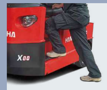
Low-level widely open foot board is very convenient for the operator to get on / off the truck