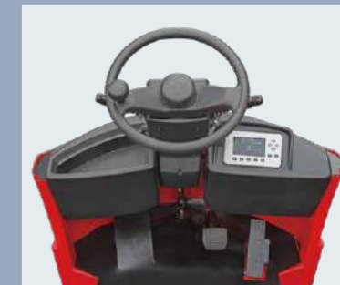
Various operating pedals, instruments, steering wheel, and switches are configured based on ergonomic requirements, and are comfortable and flexible for operation