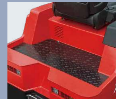
Loading platform, easy to load and unload goods